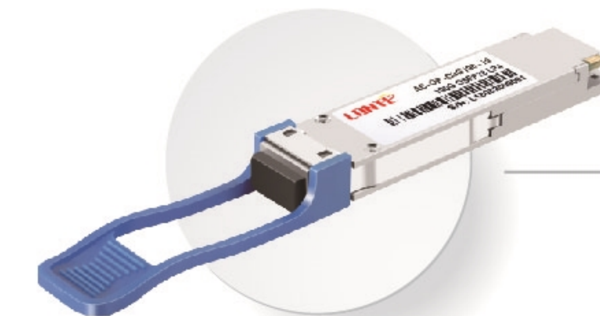
100G QSFP28 LR4