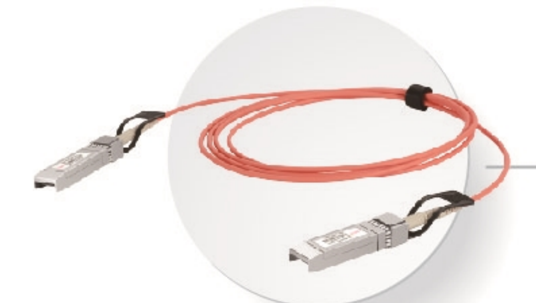
10G SFP+ AOC