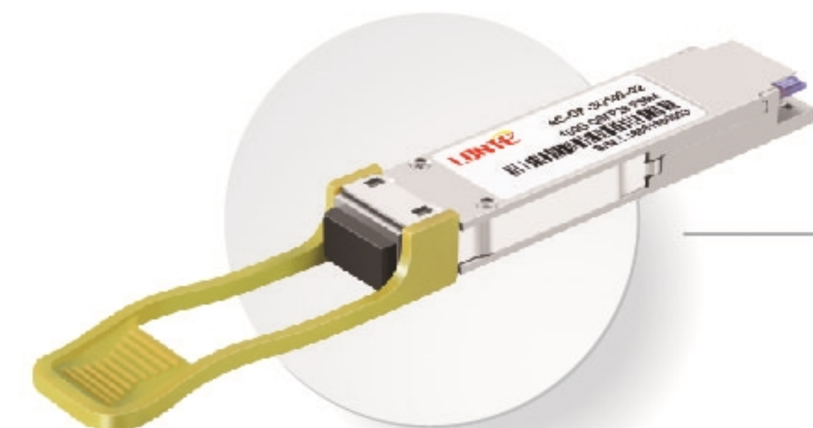
100G QSFP28 PSM4