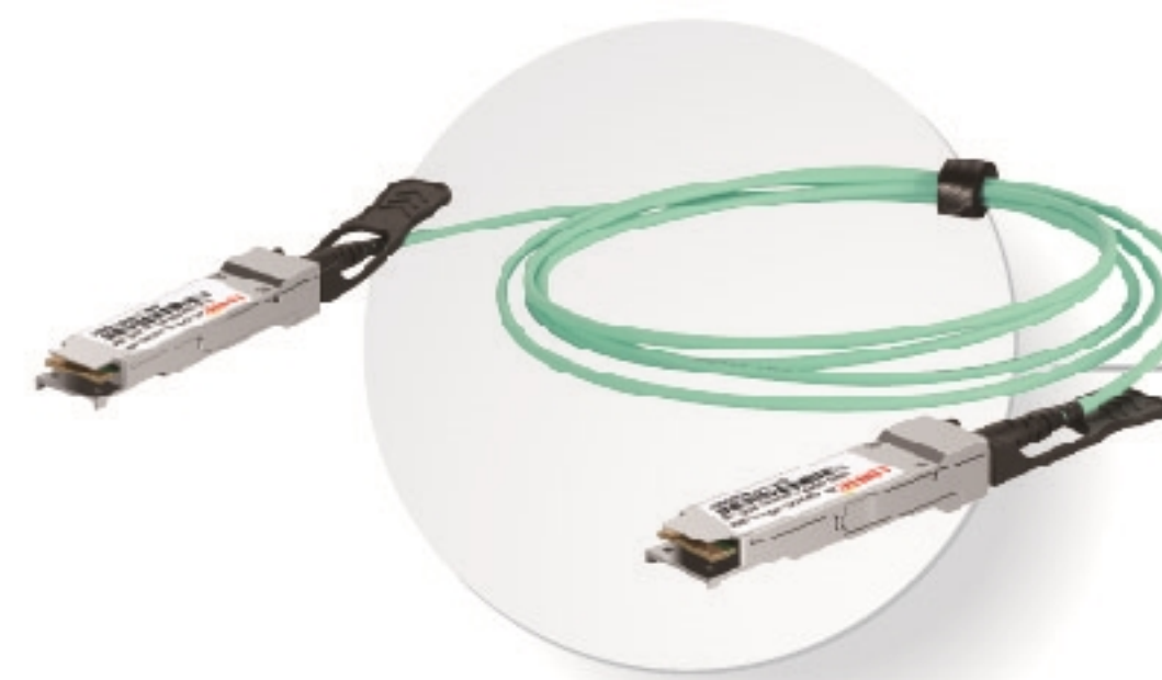
100G QSFP28 AOC