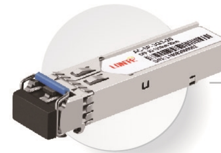
3G VIDEO SFP