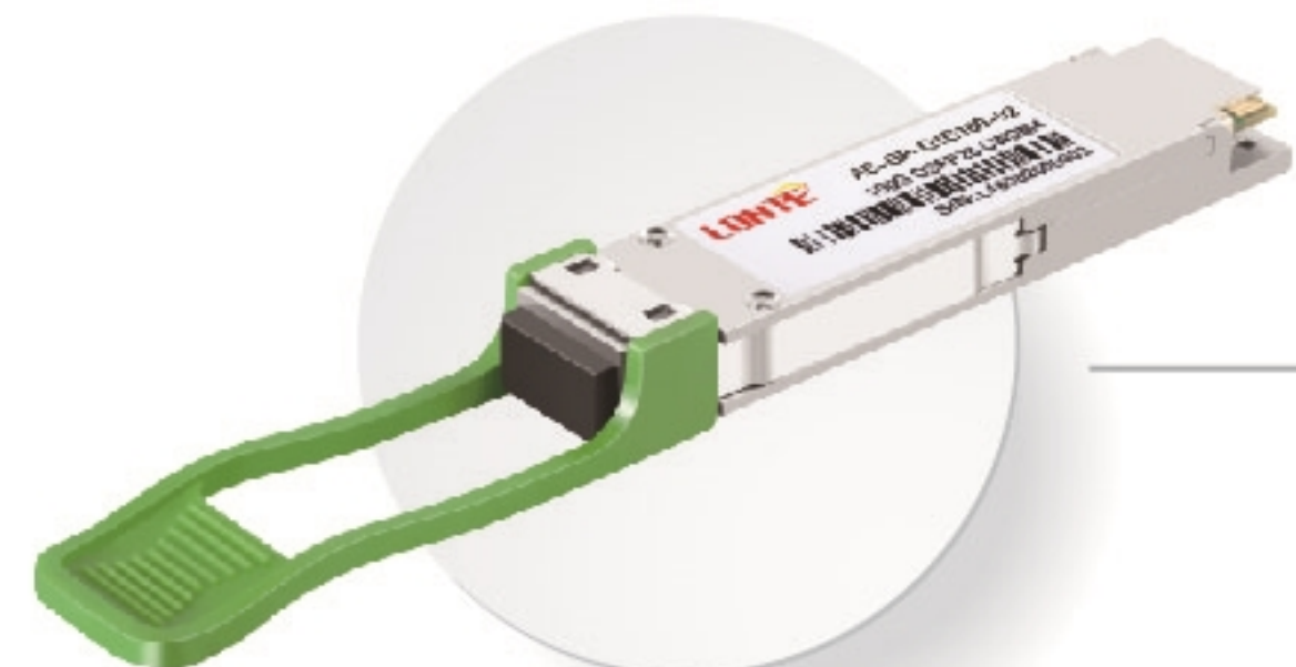
100G QSFP28 CWDM4