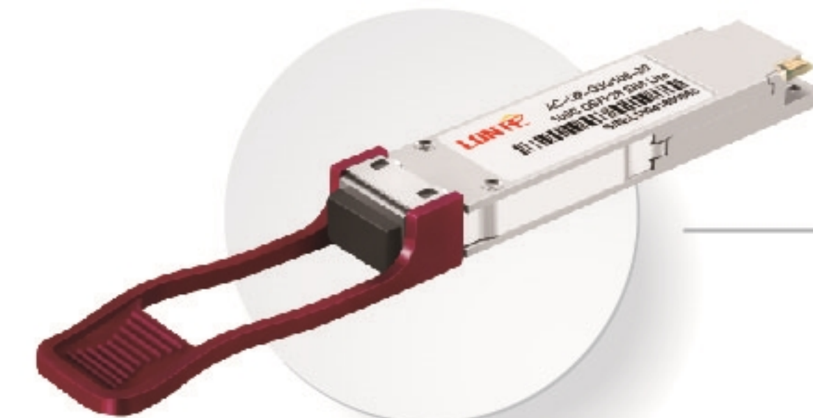
100G QSFP28 ER4 Lite