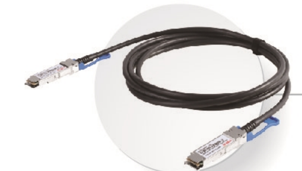
100G QSFP28 DAC