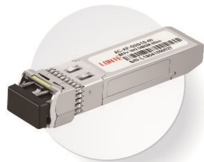
10G SFP+ CWDM/DWDM