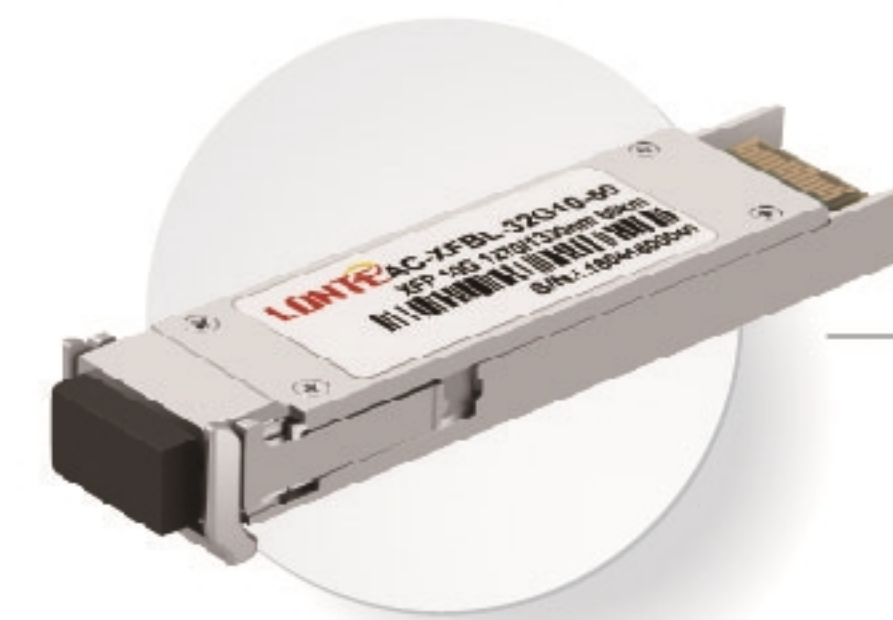
10G XFP BIDI