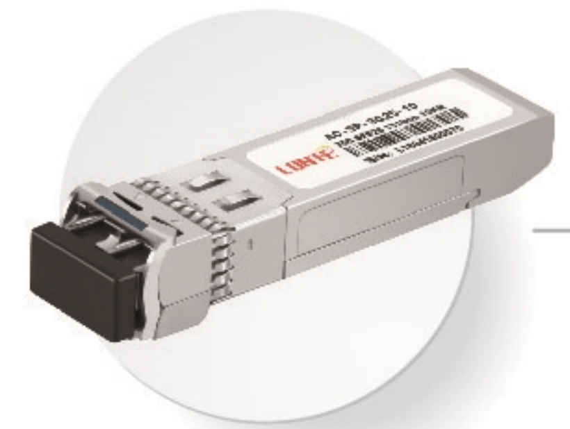
25G SFP28 LR