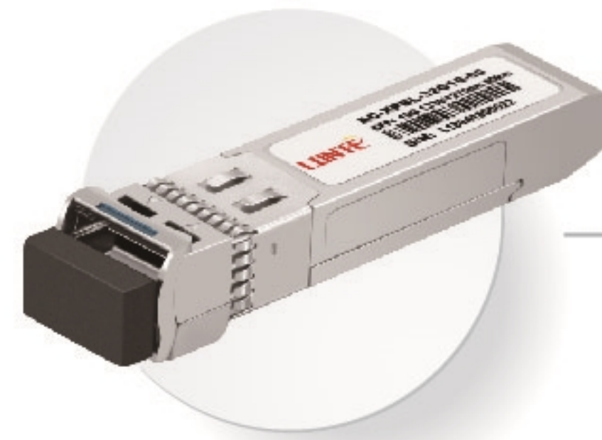
10G SFP+ BIDI