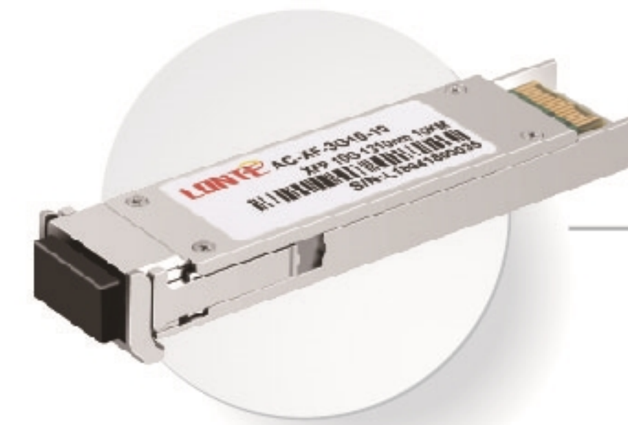
10G XFP Duplex