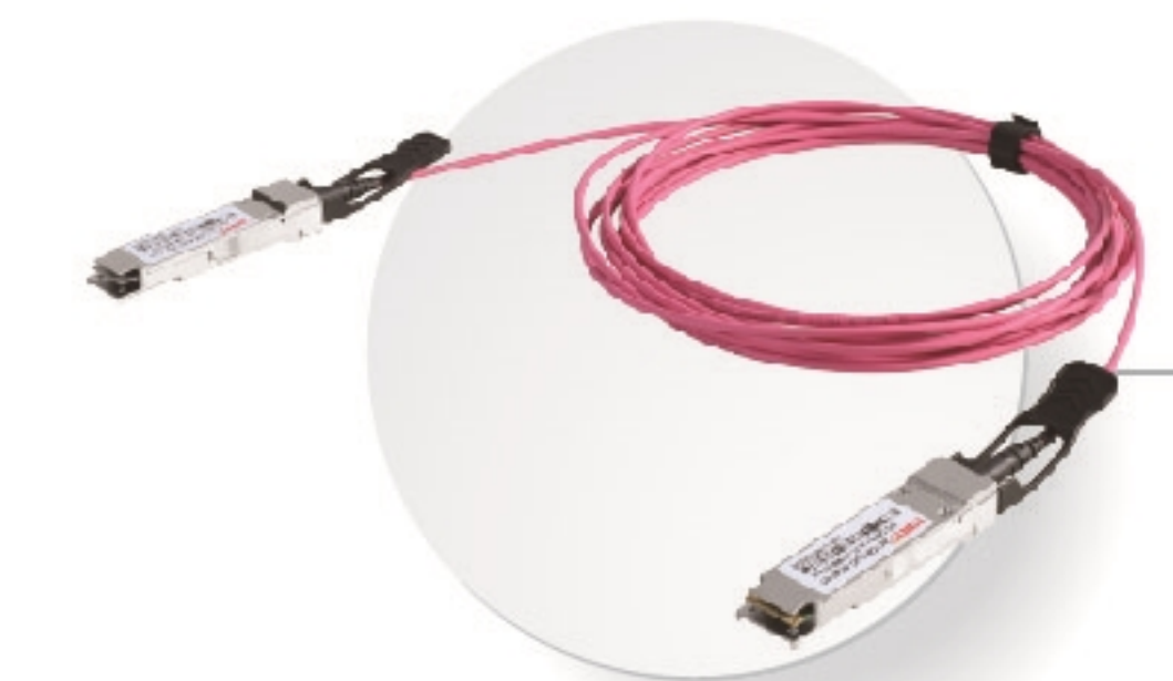
40G QSFP+ AOC