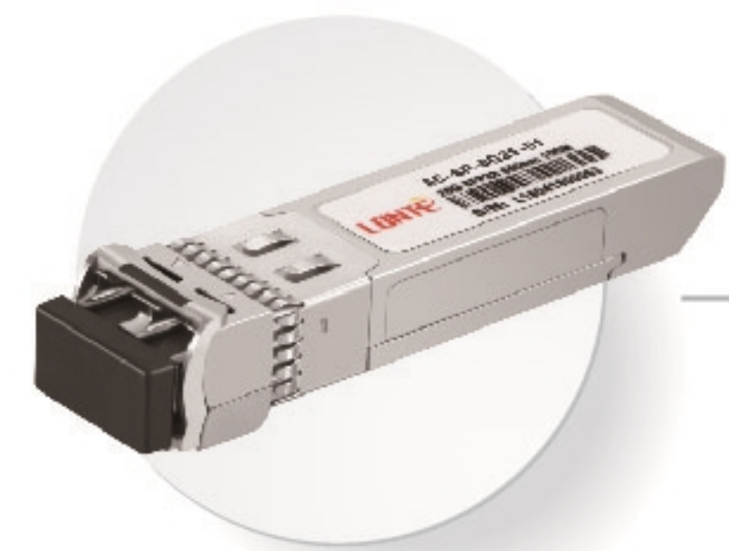
25G SFP28 SR