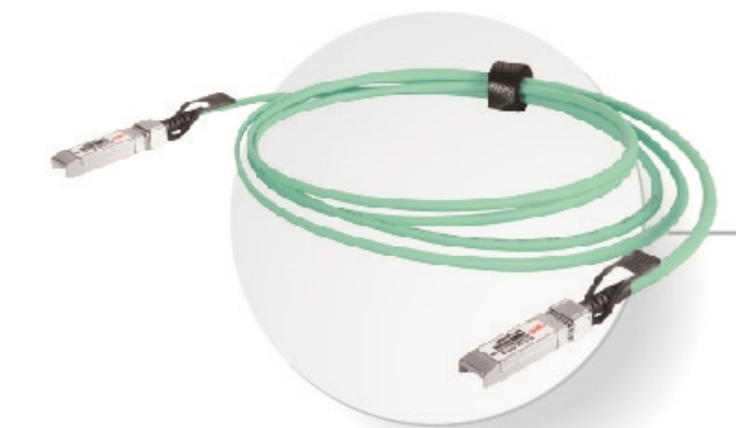
25G SFP28 AOC