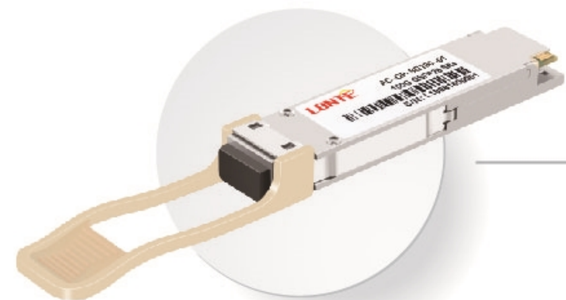
100G QSFP28 SR4