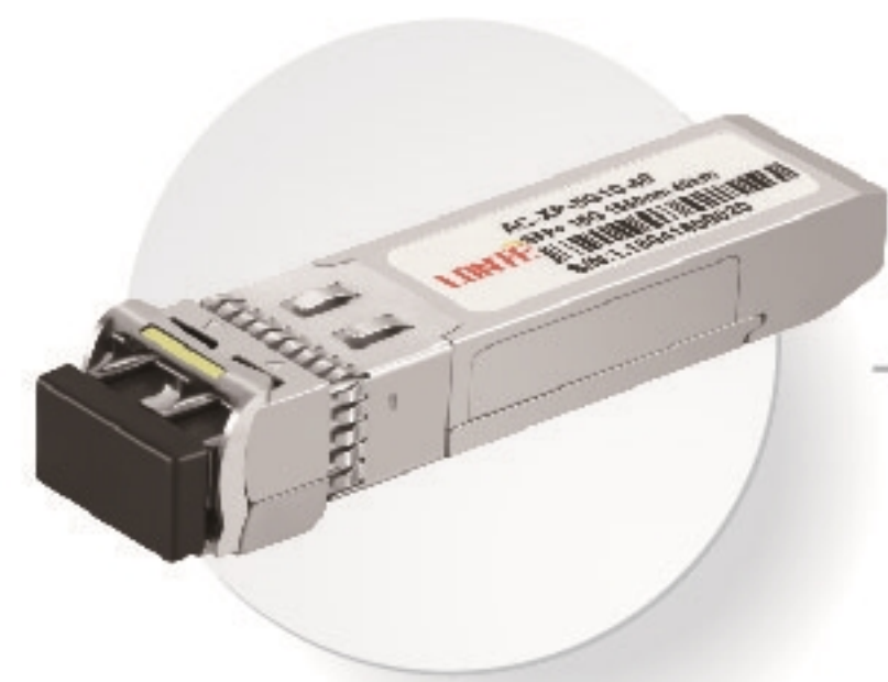
10G SFP+ Duplex