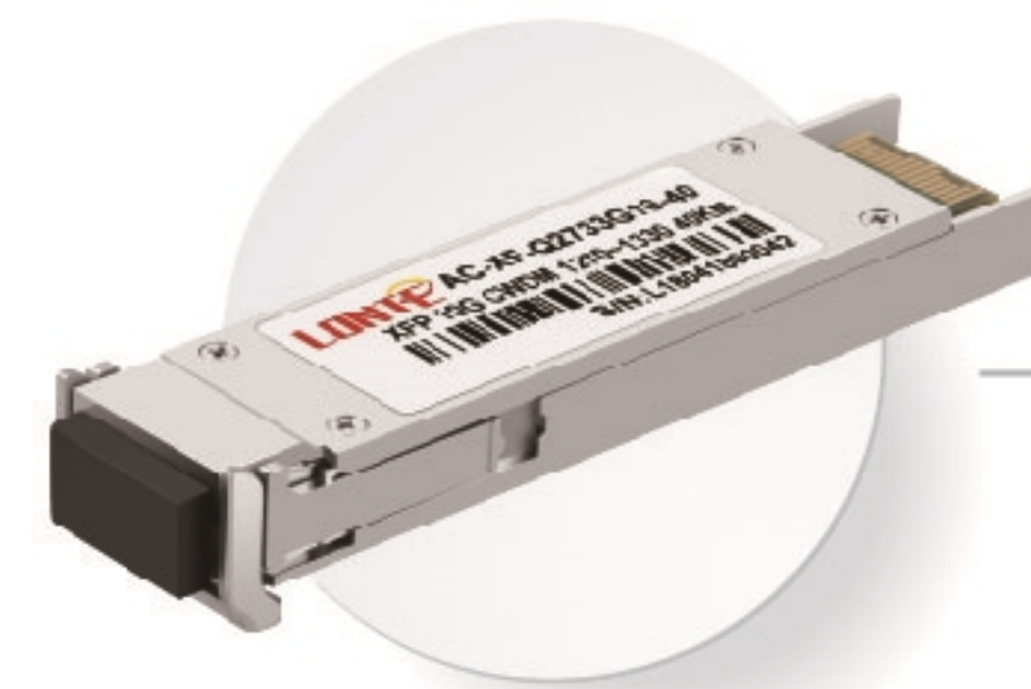
10G XFP CWDM/DWDM